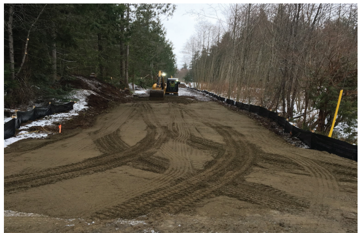
Construction along Parry Place