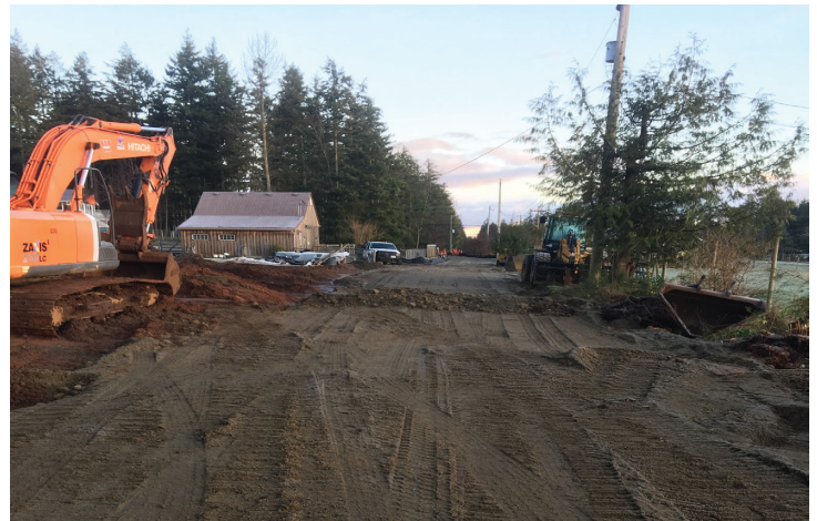
Hudson Road access

We're glad to say construction is still expected to be complete in early May 2018. Thank you for your continued patience through this important work.